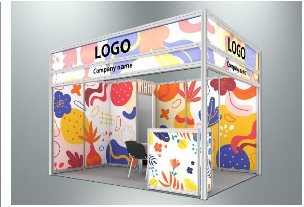
Example of stand with full-color walls design (additional service)