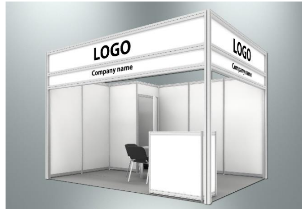
Example of standard stand design

Stand will be located near key exhibitors, what provides best visitor traffic